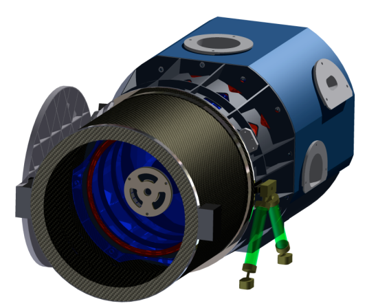
Fig. 1. J-MAPS Optical Telescope Assembly. The telescope observes in the visible and near-IR (NIR) portion of the spectrum and includes dispersive spectral gratings.

Spacecraft: The J-MAPS spacecraft consists of the payload deck (hosting the instrument) and a microsat bus, as shown in Fig. 2. The baseline design uses a customized AeroAstro Astro200 bus. Pointing control at the 50 mas level is enabled by using the primary instrument as the attitude determination system (ADS) fine guidance sensor. This is made possible by the unique readout capabilities of the CMOS-Hybrid sensor. The current baseline is required to meet a two year mission with 90% certainty; in order to accomplish this, the entire system is designed with selective component redundancy. The baseline