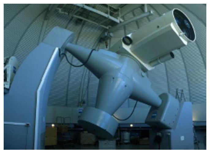
Fig. 5: ESA Space Debris Telescope, Tenerife, Spain [14]

Optical telescopes form the second major type of sensor used to track space objects. They operate in the same fashion as telescopes used for astronomy applications: electromagnetic radiation emitted by an object is gathered and focused to form an image. Refracting telescopes use lenses, while reflecting telescopes use mirrors. Catadioptric telescopes used a combination of mirrors and lenses. Although telescopes can be designed for many different parts of the EM spectrum, the visible portion is most often used for SSA. Fig. 5 shows the European Space Agency's (ESA) Space Debris Telescope, located on the island of Tenerife, Spain.