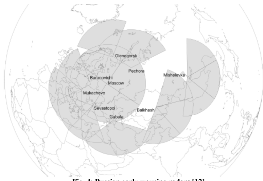
Fig. 4: Russian early warning radars [12]

Balkhash (Kazakhstan), and Mishelevka. Fig. 4 shows the location and coverage of the Russian early warning radar network.