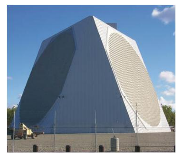
Fig. 3: PAVE PAWS phased array at Clear AFS, Alaska