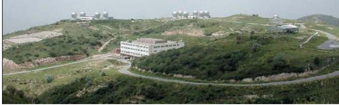
Fig. 6: Russian Okno facility[21]

The Russian military operates a significant optical tracking facility in northern Tajikistan. Known as Okno or "window", the facility includes a number of optical telescopes that can track objects in all orbital regimes, including LEO. The Okno facility provides the Russian military with coverage of the GEO belt over Russia only.