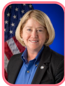
Pam Melroy Deputy Administrator NASA